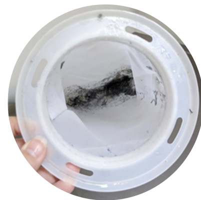
Microfibers shed from washing machines captured in a 100 µm filter